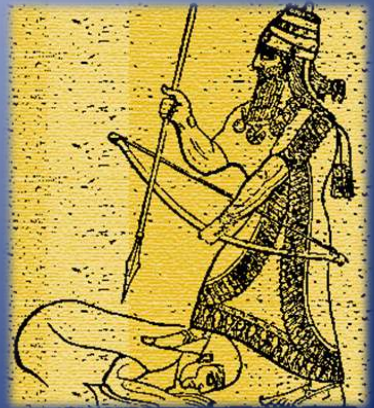
Assyrian king treads neck of enemy

Serious inditement against the Jewish audience. C.f. Genesis 3:15 'it shall bruise (Heb. shuph- to crush, to strike out) your head.'