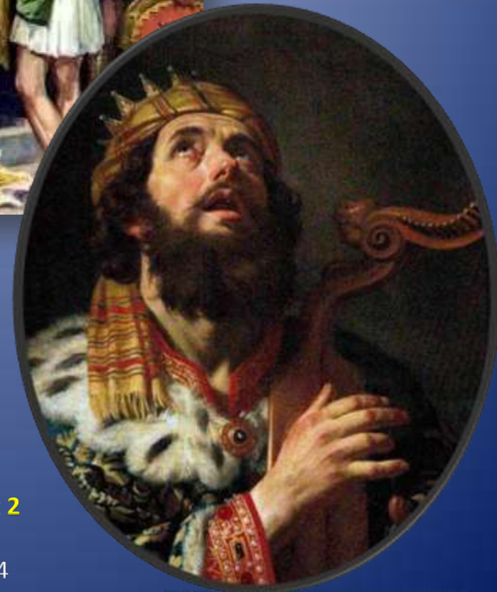
Patriarch David and the Davidic covenant 2 Samuel 7:12-14; 1 Chronicles 17:11-14